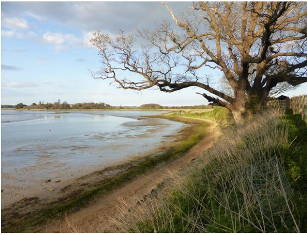
View from Iken Barns (Iken Cliff) across River Alde towards St Botolph's Church