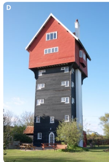
Images: Front cover – Thorpeness Meare. A. Bittern – One of North Warren's wildlife 'stars'. B. Sea Pea – Rare shingle plants grow on the beach south of Thorpeness. C. Hairy Dragonfly – Breeds in early summer in the grazing marsh dykes. D. The House in the Clouds – a vertical fantasy.

Places to eat and drink can be found near the start and finish of these walks. The Dolphin Inn and Meare Tearoom in Thorpeness are close by. A little way into your walk, Thorpeness Hotel and Golf Club welcomes hungry and thirsty walkers.