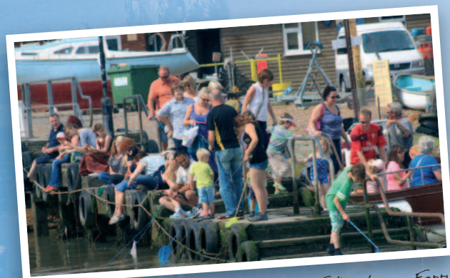
Visitors at Felixstowe Ferry