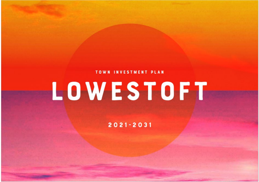
Town investment plan