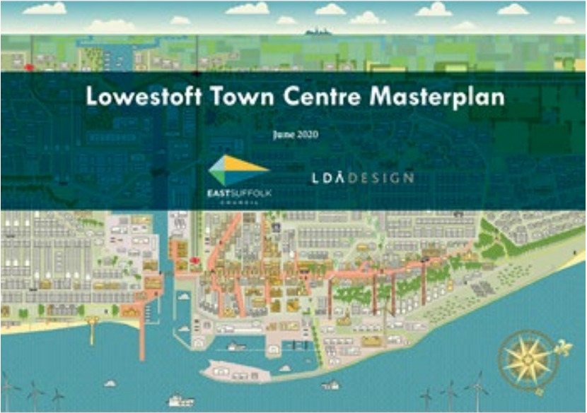
Town centre masterplan